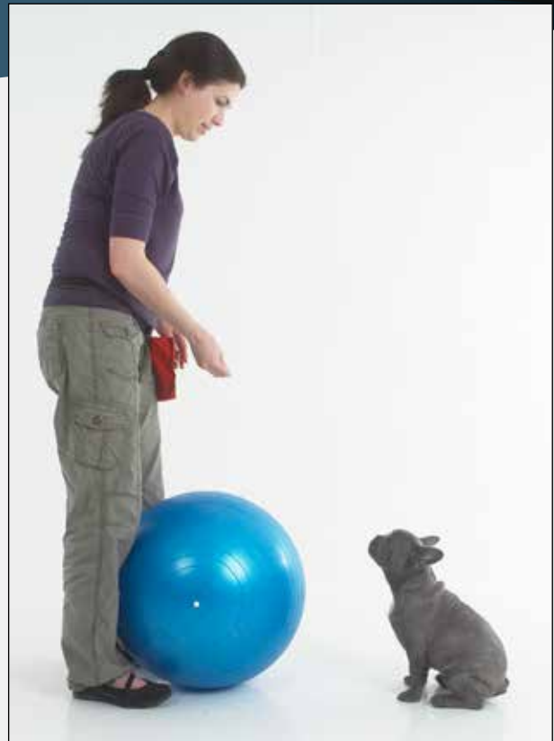
Original Photo - The puppy is posing perfectly, but in the wrong place