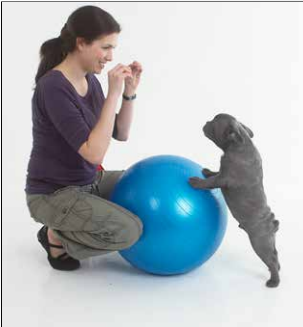
Original Photo - Model in position in front of the ball